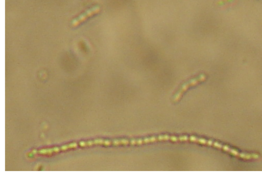
Fig. 1: Phase-contrast micrographs of tannic acid degrading bacterium (Strain AB)

Growth, physiology and metabolic properties: Strain AB was a mesophilic, facultatively anaerobic, chemo-organotrophic bacterium. The optimum growth temperature for the strain was 37°C; growth was observed between 20 and 40°C; no growth occurred at 50°C. The optimum pH for growth was pH 8 and the pH range for